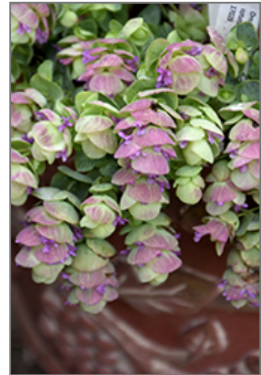
Kirigami Oregano flowers

Kirigami Oregano is recommended for the following landscape applications;