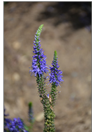
Magic Show Wizard of Ahhs Speedwell flowers