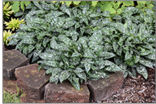
Twinkle Toes Lungwort

Twinkle Toes Lungwort will grow to be about 12 inches tall at maturity, with a spread of 18 inches. When grown in masses or used as a bedding plant, individual plants should be spaced approximately 15 inches apart. Its foliage tends to remain dense right to the ground, not requiring facer plants in front. It grows at a medium rate, and under ideal conditions can be expected to live for approximately 10 years. As an herbaceous perennial, this plant will usually die back to the crown each winter, and will regrow from the base each spring. Be careful not to disturb the crown in late winter when it may not be readily seen!