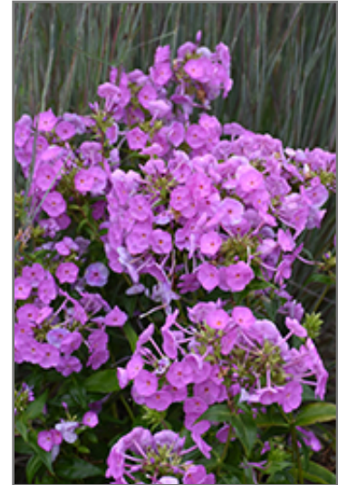
Fashionably Early Flamingo Garden Phlox flowers