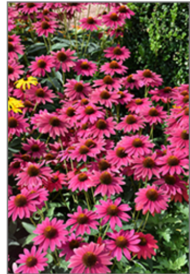
Sombrero Tres Amigos Coneflower flowers

Sombrero Tres Amigos Coneflower will grow to be about 16 inches tall at maturity extending to 24 inches tall with the flowers, with a spread of 24 inches. Its foliage tends to remain dense right to the ground, not requiring facer plants in front. It grows at a medium rate, and under ideal conditions can be expected to live for approximately 10 years. As an herbaceous perennial, this plant will usually die back to the crown each winter, and will regrow from the base each spring. Be careful not to disturb the crown in late winter when it may not be readily seen!