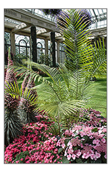
Majesty Palm

When grown indoors, Majesty Palm can be expected to grow to be about 10 feet tall at maturity, with a spread of 5 feet. It grows at a fast rate, and under ideal conditions can be expected to live for approximately 20 years. This houseplant performs well in both bright or indirect sunlight and strong artificial light, and can therefore be situated in almost any well-lit room or location. It does best in average to evenly moist soil, but will not tolerate standing water. The surface of the soil shouldn't be allowed to dry out completely, and so you should expect to water this plant once and possibly even twice each week. Be aware that your particular watering schedule may vary depending on its location in the room, the pot size, plant size and other conditions; if in doubt, ask one of our experts in the store for advice. It is not particular as to soil pH, but grows best in rich soil. Contact the store for specific recommendations on pre-mixed potting soil for this plant.