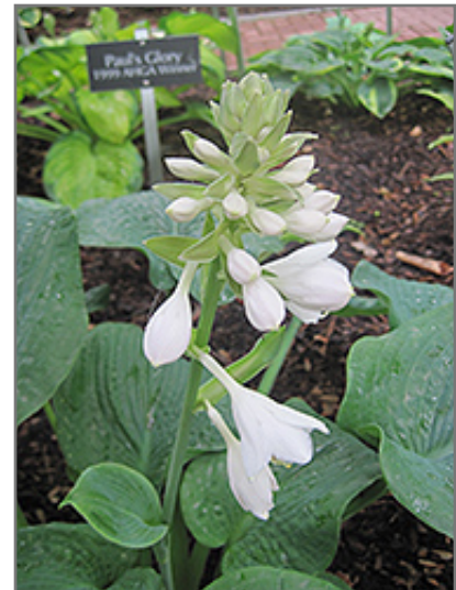
Elegans Hosta flowers