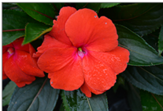
Magnum Red Flame New Guinea Impatiens flowers

Magnum Red Flame New Guinea Impatiens is recommended for the following landscape applications;