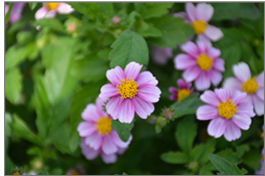
Pretty in Pink Bidens flowers