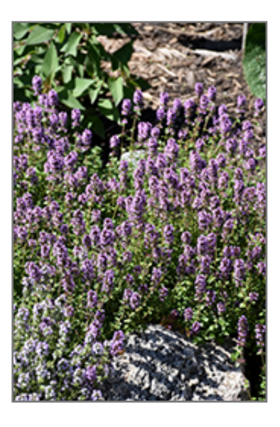
Oregano Thyme in bloom