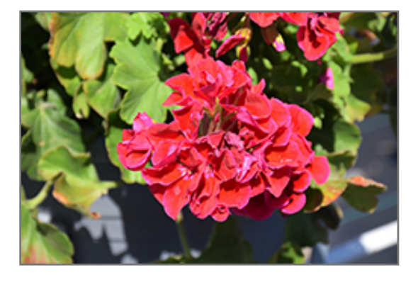
Calliope Medium Crimson Flame Geranium flowers