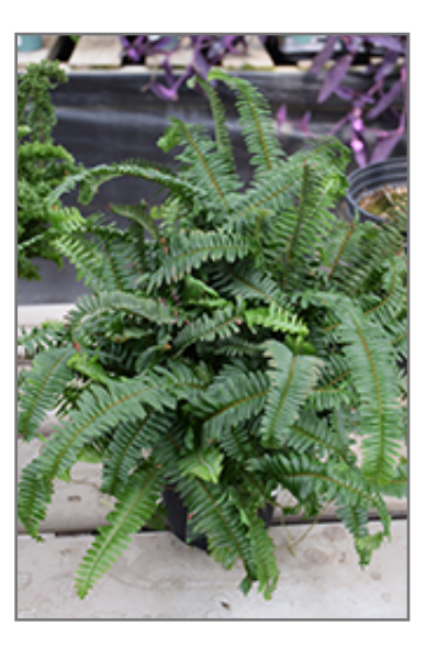
Kimberley Queen Australian Sword Fern in full

When grown indoors, Kimberley Queen Australian Sword Fern can be expected to grow to be about 3 feet tall at maturity, with a spread of 3 feet. It grows at a fast rate, and under ideal conditions can be expected to live for approximately 20 years. This houseplant performs well in both bright or indirect sunlight and strong artificial light, and can therefore be situated in almost any well-lit room or location. It does best in average to evenly moist soil, but will not tolerate standing water. The surface of the soil shouldn't be allowed to dry out completely, and so you should expect to water this plant once and possibly even twice each week. Be aware that your particular watering schedule may vary depending on its location in the room, the pot size, plant size and other conditions; if in doubt, ask one of our experts in the store for advice. It is not particular as to soil pH, but grows best in rich soil. Contact the store for specific recommendations on pre-mixed potting soil for this plant.