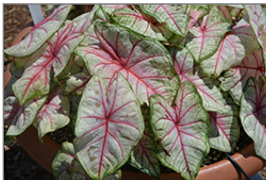
Summer Breeze Caladium foliage