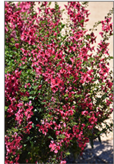
Archangel Cherry Red Angelonia flowers

Archangel Cherry Red Angelonia is an herbaceous annual with an upright spreading habit of growth. Its relatively fine texture sets it apart from other garden plants with less refined foliage.