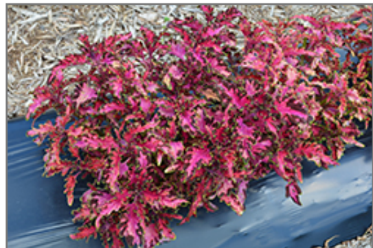
Under The Sea Pink Reef Coleus