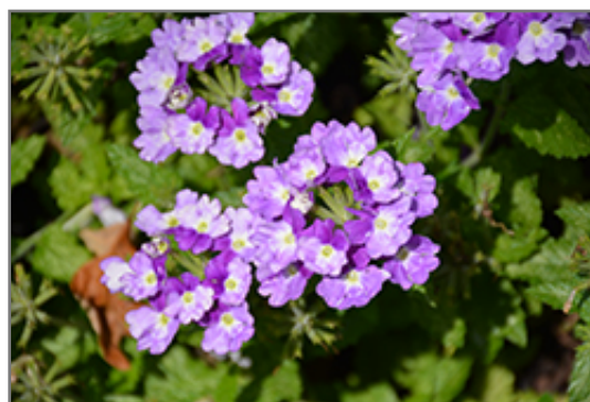
Superbena Sparkling Amethyst Verbena flowers