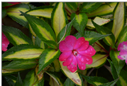
SunPatiens Compact Tropical Rose New Guinea Impatiens flowers