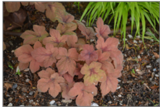
Pumpkin Spice Foamy Bells