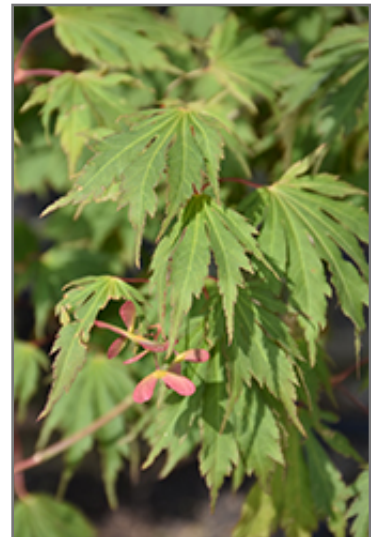
Northern Glow Maple foliage