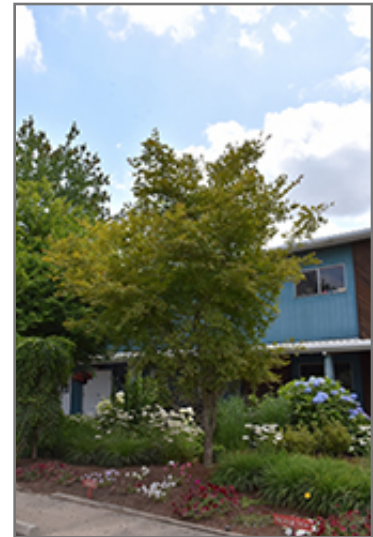
Northern Glow Maple

This tree does best in full sun to partial shade. It does best in average to evenly moist conditions, but will not tolerate standing water. It is not particular as to soil type or pH. It is somewhat tolerant of urban pollution. This particular variety is an interspecific hybrid.