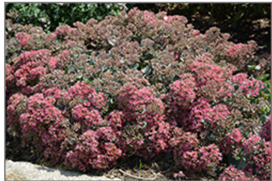
Popstar Stonecrop in bloom