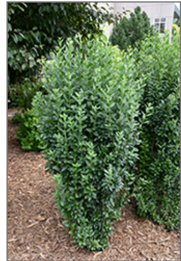
Straight Talk Privet