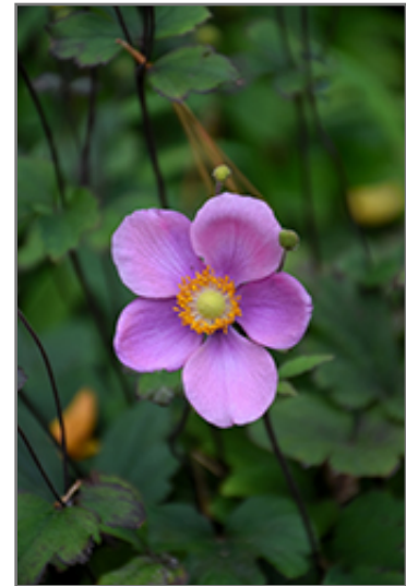
Lucky Charm Anemone flowers