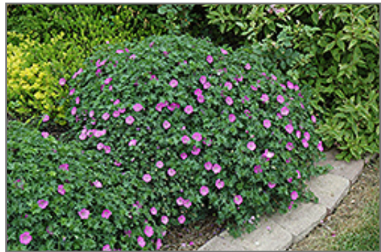
Bloody Cranesbill in bloom