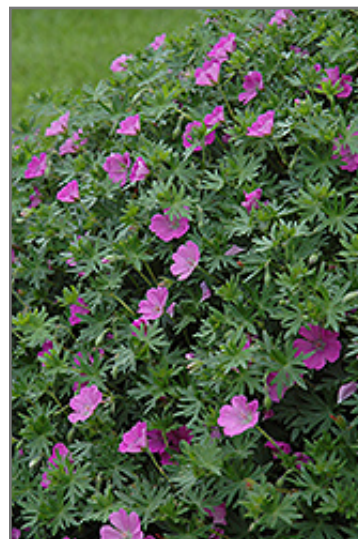
Bloody Cranesbill flowers