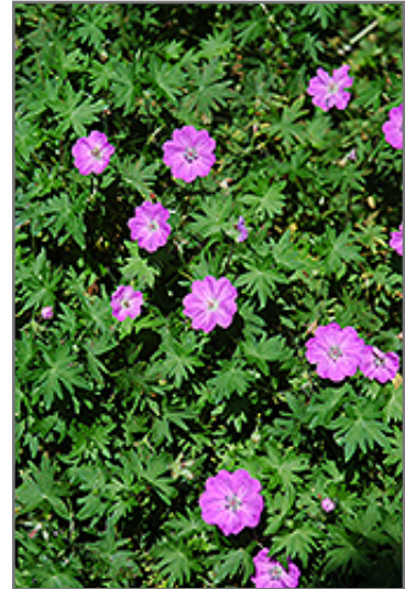
Bloody Cranesbill flowers