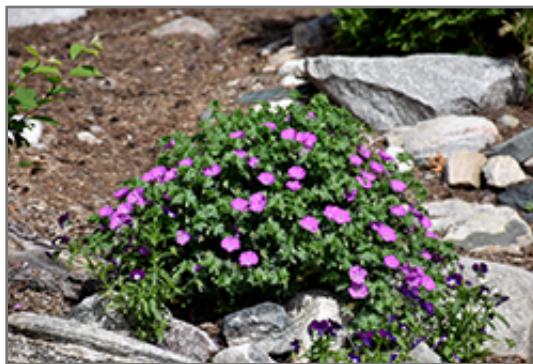
Bloody Cranesbill in bloom