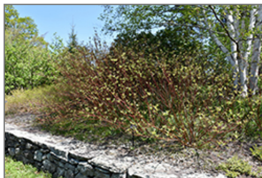
Bailey's Red Twig Dogwood in spring