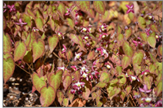
Bishop's Hat in bloom

Bishop's Hat will grow to be about 12 inches tall at maturity, with a spread of 18 inches. When grown in masses or used as a bedding plant, individual plants should be spaced approximately 15 inches apart. Its foliage tends to remain dense right to the ground, not requiring facer plants in front. It grows at a medium rate, and under ideal conditions can be expected to live for approximately 10 years.