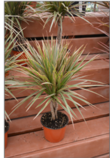
Colorama Dracaena in full

When grown indoors, Colorama Dracaena can be expected to grow to be about 3 feet tall at maturity, with a spread of 24 inches. It grows at a medium rate, and under ideal conditions can be expected to live for approximately 10 years. This houseplant performs well in both bright or indirect sunlight and strong artificial light, and can therefore be situated in almost any well-lit room or location. It does best in average to evenly moist soil, but will not tolerate standing water. The surface of the soil shouldn't be allowed to dry out completely, and so you should expect to water this plant once and possibly even twice each week. Be aware that your particular watering schedule may vary depending on its location in the room, the pot size, plant size and other conditions; if in doubt, ask one of our experts in the store for advice. It is not particular as to soil type or pH; an average potting soil should work just fine.