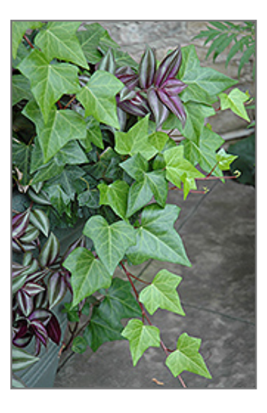
Algerian Ivy foliage

When grown indoors, Algerian Ivy can be expected to grow to be about 10 feet tall at maturity, with a spread of 3 feet. It grows at a fast rate, and under ideal conditions can be expected to live for approximately 30 years. This houseplant performs well in both bright or indirect sunlight and strong artificial light, and can therefore be situated in almost any well-lit room or location. It is very adaptable to both dry and moist soil, and should do just fine under average home conditions. The surface of the soil shouldn't be allowed to dry out completely, and so you should expect to water this plant once and possibly even twice each week. Be aware that your particular watering schedule may vary depending on its location in the room, the pot size, plant size and other conditions; if in doubt, ask one of our experts in the store for advice. It is not particular as to soil pH, but grows best in rich soil. Contact the store for specific recommendations on pre-mixed potting soil for this plant. Be warned that parts of this plant are known to be toxic to humans and animals, so special care should be exercised if growing it around children and pets.