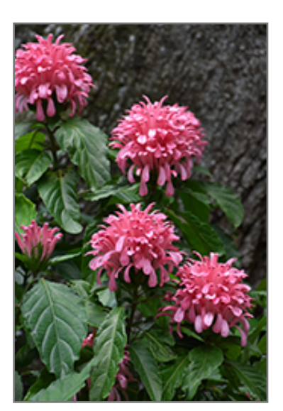
Brazilian Plume Flower flowers

When grown indoors, Brazilian Plume Flower can be expected to grow to be about 3 feet tall at maturity, with a spread of 24 inches. It grows at a fast rate, and under ideal conditions can be expected to live for approximately 30 years. This houseplant will do well in a location that gets either direct or indirect sunlight, although it will usually require a more brightly-lit environment than what artificial indoor lighting alone can provide. It prefers to grow in average to moist soil. The surface of the soil shouldn't be allowed to dry out completely, and so you should expect to water this plant once and possibly even twice each week. Be aware that your particular watering schedule may vary depending on its location in the room, the pot size, plant size and other conditions; if in doubt, ask one of our experts in the store for advice. It is not particular as to soil pH, but grows best in rich soil. Contact the store for specific recommendations on pre-mixed potting soil for this plant.