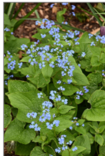
Siberian Bugloss flowers