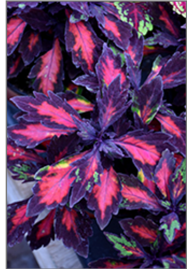
Marquee Special Effects Coleus foliage

Marquee Special Effects Coleus is recommended for the following landscape applications;