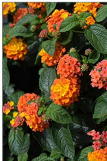
Lucky Flame Lantana flowers