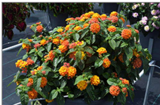
Lucky Flame Lantana in bloom

Lucky Flame Lantana will grow to be about 16 inches tall at maturity, with a spread of 14 inches. When grown in masses or used as a bedding plant, individual plants should be spaced approximately 12 inches apart. Although it's not a true annual, this fast-growing plant can be expected to behave as an annual in our climate if left outdoors over the winter, usually needing replacement the following year. As such, gardeners should take into consideration that it will perform differently than it would in its native habitat.