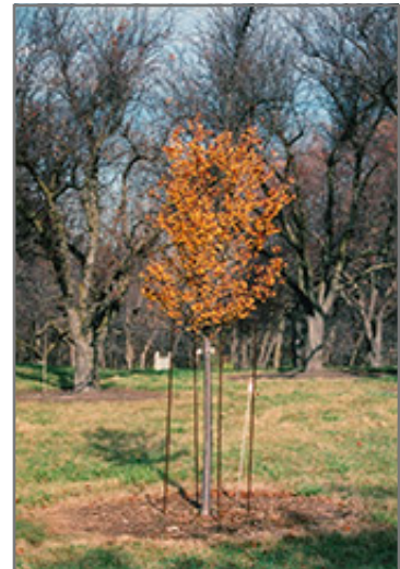
Lancelot Flowering Crab fruit