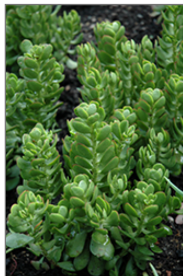
Red Carpet Stonecrop