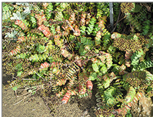
String Of Buttons

String Of Buttons is recommended for the following landscape applications;