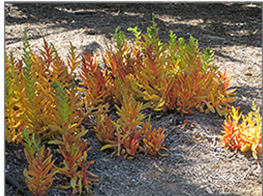
Campfire Crassula