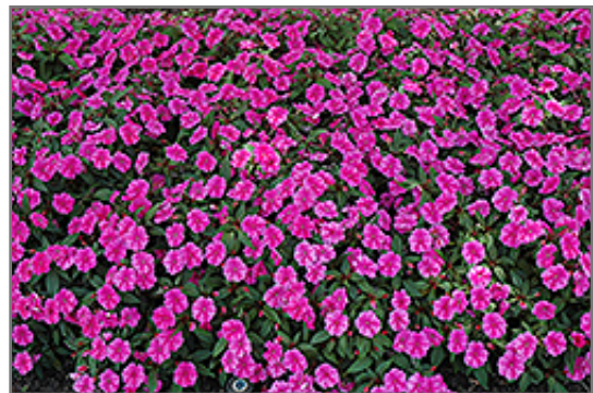
Bounce Pink Flame Impatiens in bloom