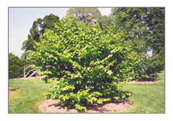
Common Witchhazel