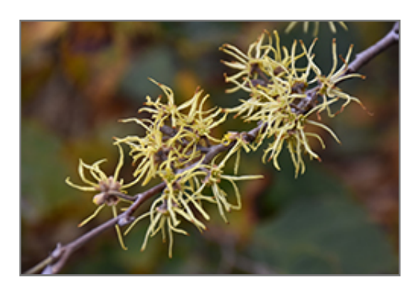
Common Witchhazel flowers