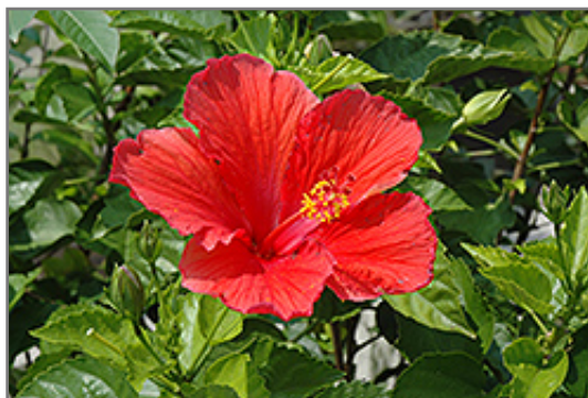
Red Hibiscus flowers

This plant does best in full sun to partial shade. It requires an evenly moist well-drained soil for optimal growth, but will die in standing water. It is not particular as to soil type or pH. It is highly tolerant of urban pollution and will even thrive in inner city environments. Consider applying a thick mulch around the root zone in winter to protect it in exposed locations or colder microclimates. This is a selected variety of a species not originally from North America. It can be propagated by cuttings; however, as a cultivated variety, be aware that it may be subject to certain restrictions or prohibitions on propagation.