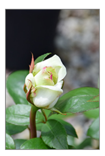
Sugar Moon Rose flower buds

This shrub should only be grown in full sunlight. It does best in average to evenly moist conditions, but will not tolerate standing water. It is not particular as to soil type or pH. It is somewhat tolerant of urban pollution. This particular variety is an interspecific hybrid.