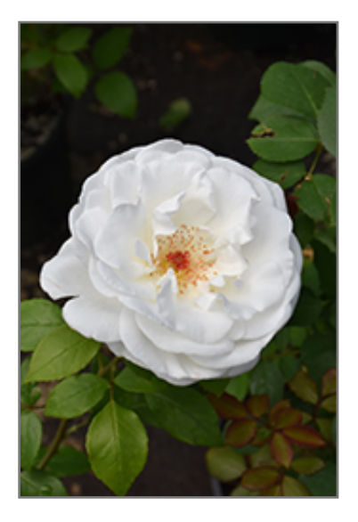
Sugar Moon Rose flowers