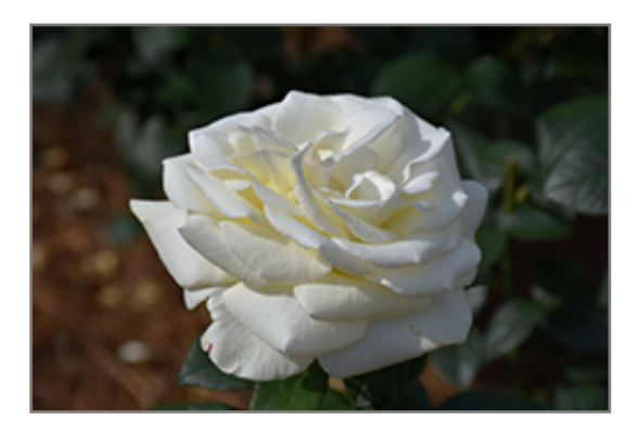
Sugar Moon Rose flowers

Sugar Moon Rose is recommended for the following landscape applications;