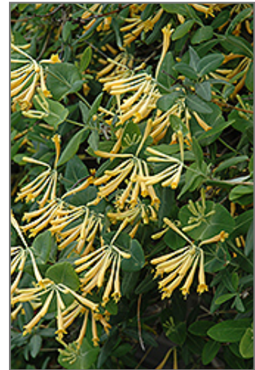
John Clayton Trumpet Honeysuckle flowers