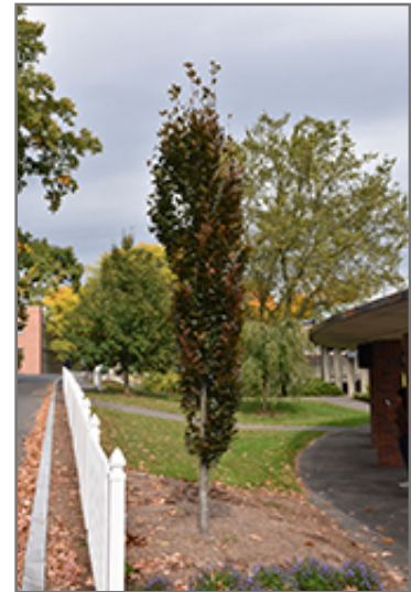
Dawyck Purple Beech