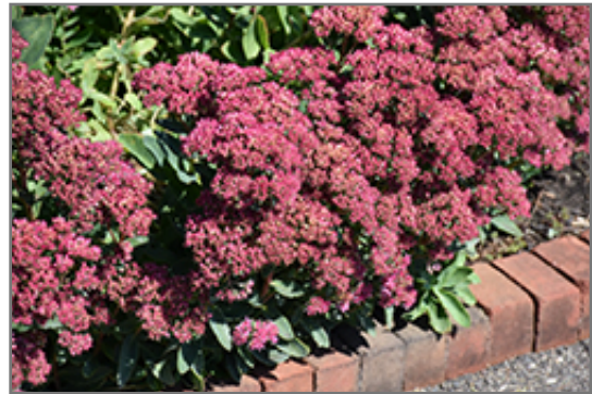
Carl Stonecrop in bloom

This is a relatively low maintenance plant, and is best cleaned up in early spring before it resumes active growth for the season. It is a good choice for attracting bees and butterflies to your yard, but is not particularly attractive to deer who tend to leave it alone in favor of tastier treats. It has no significant negative characteristics.