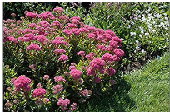
Carl Stonecrop in bloom