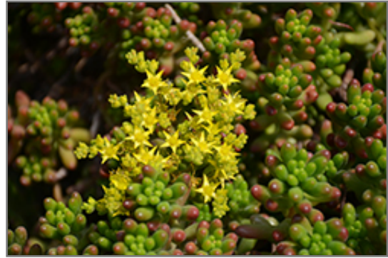
Jelly Bean Plant flowers

Jelly Bean Plant will grow to be only 5 inches tall at maturity, with a spread of 14 inches. When grown in masses or used as a bedding plant, individual plants should be spaced approximately 10 inches apart. Its foliage tends to remain low and dense right to the ground. It grows at a medium rate, and under ideal conditions can be expected to live for approximately 10 years. As an evergreen perennial, this plant will typically keep its form and foliage year-round.