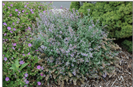
Cat's Meow Catmint in bloom