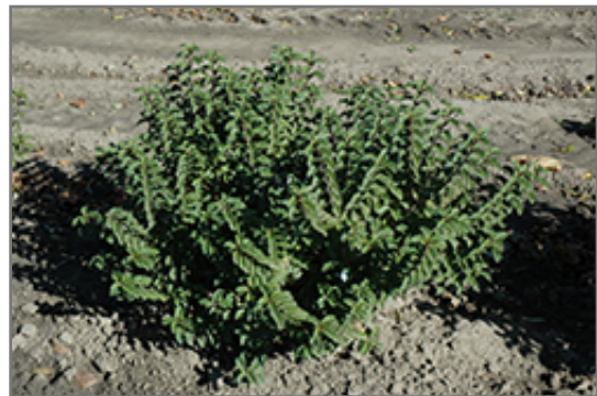
Pucker Up Red Twig Dogwood