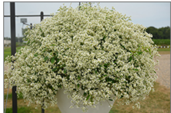
Stardust Super Flash Euphorbia in bloom