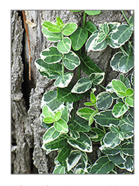
Emerald Gaiety Wintercreeper foliage