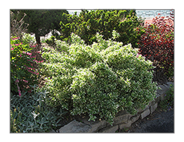
Emerald Gaiety Wintercreeper

Emerald Gaiety Wintercreeper is recommended for the following landscape applications;