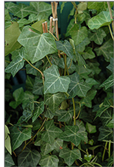
Thorndale Ivy foliage