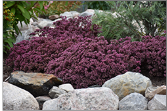
Cherry Tart Stonecrop in bloom

Cherry Tart Stonecrop is a dense herbaceous perennial with an upright spreading habit of growth. Its medium texture blends into the garden, but can always be balanced by a couple of finer or coarser plants for an effective composition.