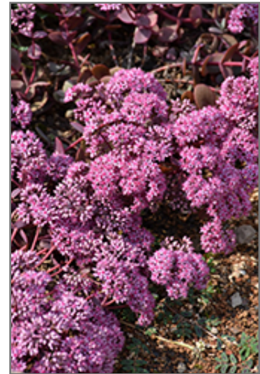
Cherry Tart Stonecrop flowers

Our Growing Place Choice plants are chosen because they are strong performers year after year, staying attractive with less maintenance when planted in the right place.