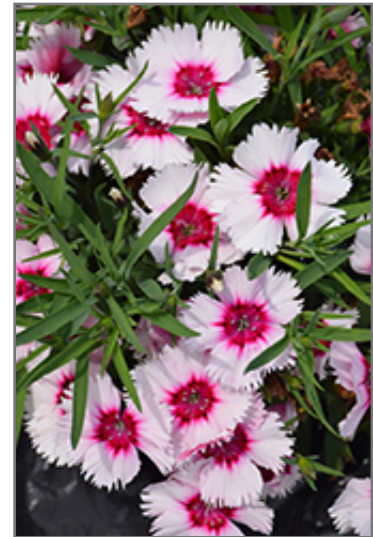
Super Parfait Raspberry Pinks flowers

Super Parfait Raspberry Pinks is a fine choice for the garden, but it is also a good selection for planting in outdoor pots and containers. It is often used as a 'filler' in the 'spiller-thriller-filler' container combination, providing a mass of flowers and foliage against which the thriller plants stand out. Note that when growing plants in outdoor containers and baskets, they may require more frequent waterings than they would in the yard or garden.